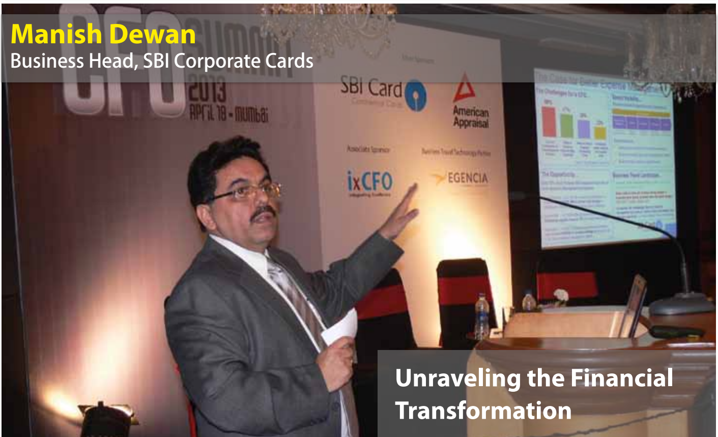
Unraveling the Financial Transformation